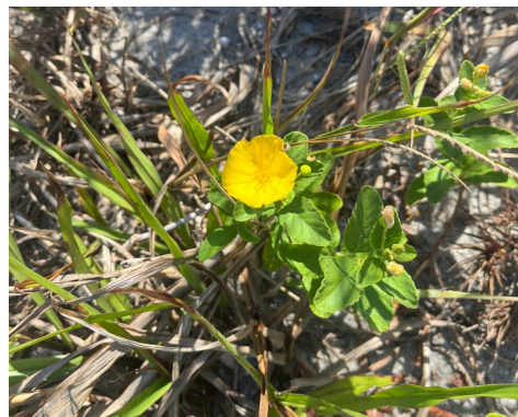
Piriqueta cistoides ( Pitted stripeeed )

IRC has an E-Trade account. Please contact us about giving gifts of stock.